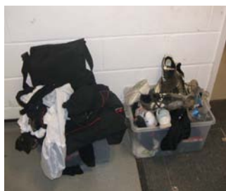
PE Department lost property

If your child has lost their PE kit, please send them with alternative kit, with a note explaining why. If the PE kit does not turn up within two weeks pupils will be asked to replace it.