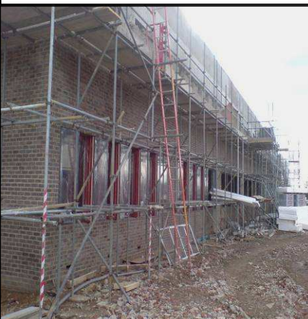
Windows are now being installed in the new block and the external brickwork is being completed.

Tuesday 6th February Girls' football training session with Arsenal player and England Captain, Faye White