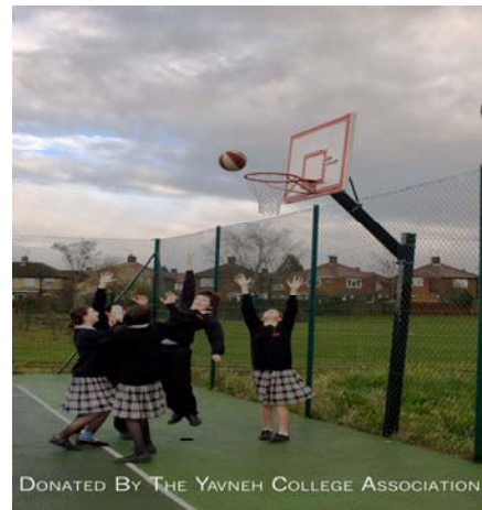
DONATED BY THE YAVNEH COLLEGE ASSOCIATION