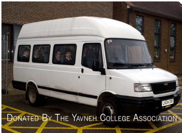
DONATED BY THE YAVNEH COLLEGE ASSOCIATION