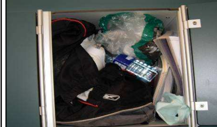
Need we say more!