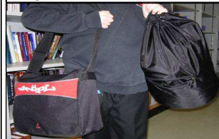
Good choice! This school bag and kit bag will easily fit into the same locker