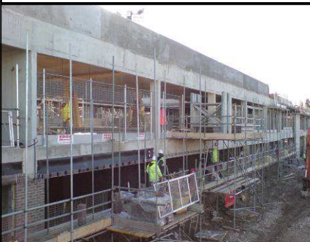
The main block has now reached roof height