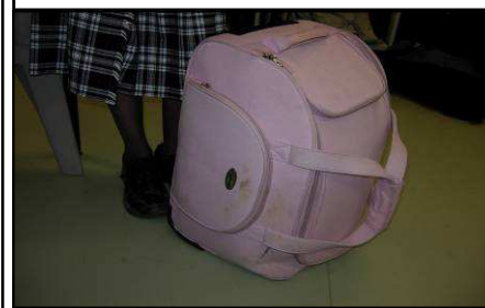
Too big! Will not fit in a locker or a bag store